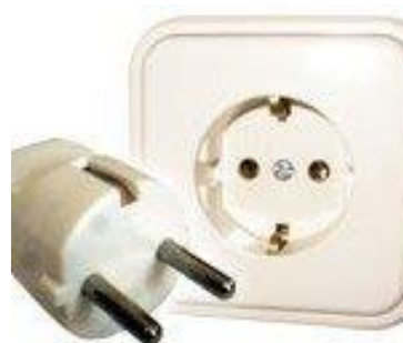
Plug Type F

For more practical information on Romania, please visit this website .