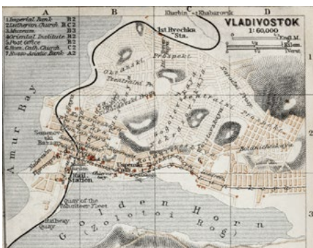
Baedeker - "Vladivostok", in Russia with Teheran, Port Arthur, and Peking, Leipzig: Karl Baedeker, 1914, OCLC 1328163