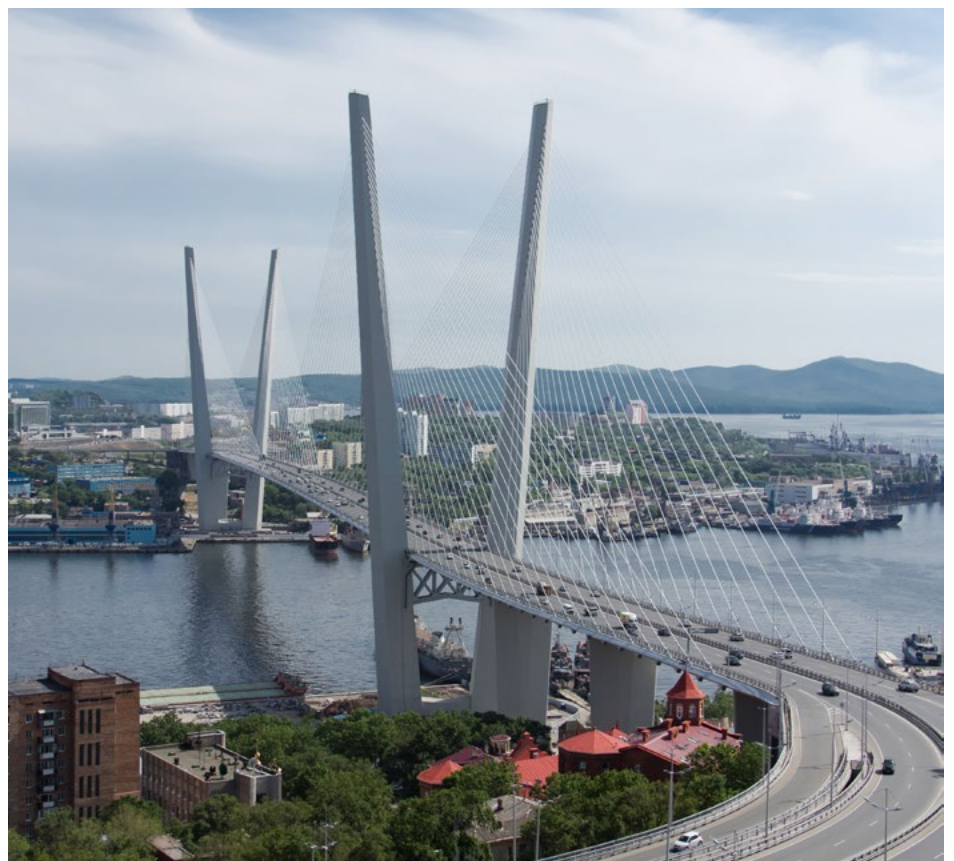
Daniil Ryzhkov, CC BY-SA 3.0