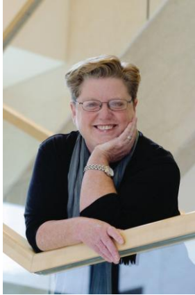
Robyn ARCHER presenter

Creative Director The Centenary of Canberra (2013), Australia Artistic Director The Light in Winter, Melbourne, Australia