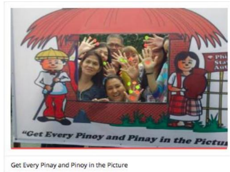
Get Every Pinoy and Pinay in the Picture