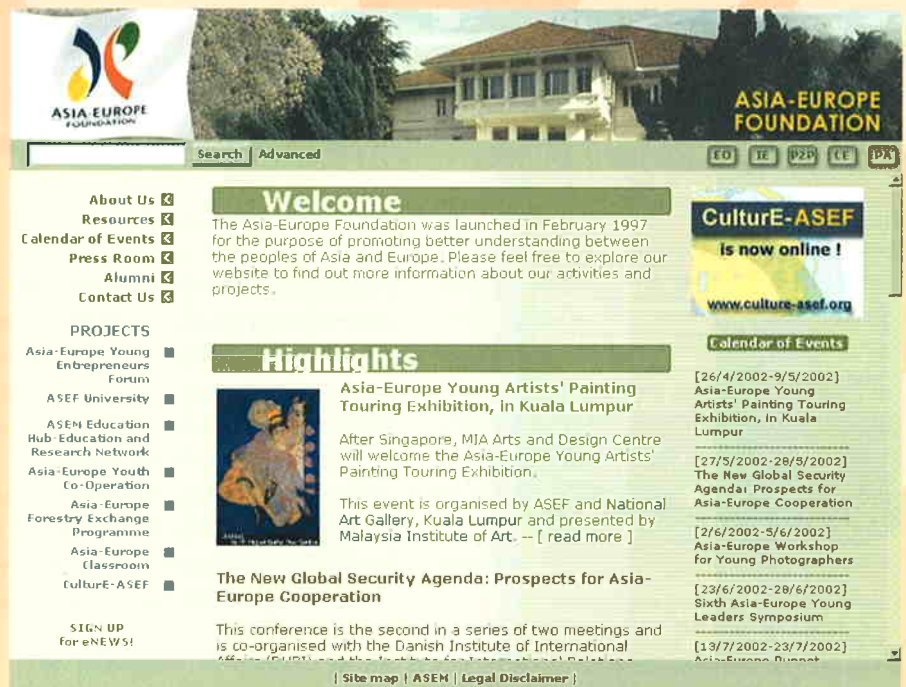
The new homepage

Exclusively open to the press who have signed up as members, the section gives access to information catered specifically for them. This would include details on press events, embargoed speeches, programmes, etc. Press members must be 'invited' and will be allowed access only after their e-mails have been verified.