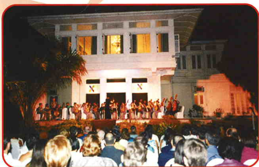
Asia-Europe Concert: A Musical Experience at the ASEF lawn, 16 February

Prof. S Jayakumar, Minister for Foreign Affairs and Law, Singapore