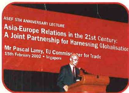
EU Commissioner for Trade Pascal Lamy

The present world situation is volatile at best and efforts to promote understanding between peoples of different beliefs and cultures are more important than ever. By means of well-defined projects, ASEF has brought Asians and Europeans of all walks of life closer together for the past five years. On this anniversary, the dedication of the ASEF staff members deserves recognition: I congratulate them and wish them well for the future.