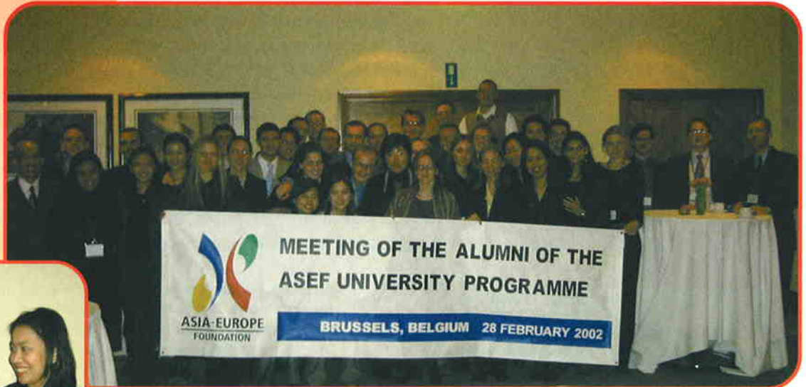
Participants of all past ASEF University Programmes from 18 ASEM countries attended the Meeting

F orty-five former participants of the past five ASEF University's attended a reunion in Brussels to consider the establishment of an official alumni network.