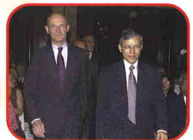
(L-R) Commissioner Lamy and Second Minister for Foreign Affairs of Singapore, Lee Yock Suan