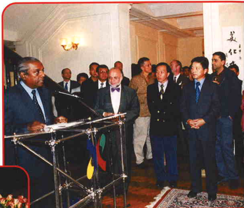
(Above) Prof. S. Jayakumar speaking at the anniversary reception at ASEF, 15 February