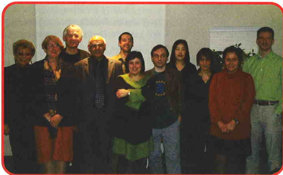
Group photo of the directors of Asian film festivals in Europe and guests

With the co-operation of the Asian Film Festival Paris committee, a special roundtable with the directors of Asian Film Festivals in Europe (Vezoul, Paris, Berlin, Udine and Barcelona) was organised for the first time. This first meeting highlighted the similarities and differences among Asian Film Festivals' approaches in Europe while emphasizing the need for more co-ordination to face the increasing competition among Film Festivals.