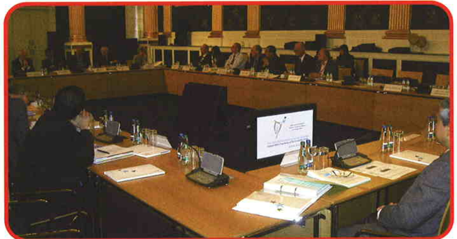
During the Board Meeting

In addition to approving new projects and reviewing the financial records, the Governors also discussed about the long-term sustainability of the Foundation. A paper will be submitted to the Senior Officials of ASEM and the Foreign Ministers prior to the ASEM Summit in Hanoi this year.