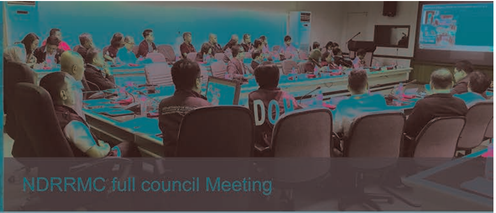
NDRRMC full council Meeting