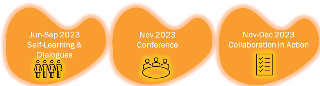
Image 2: Key Elements of Faculty Collaboration Activity of the ASEFClassNet16 Project

To learn more please read pg. 5-6 of the ASEFClassNet16 Concept Note .