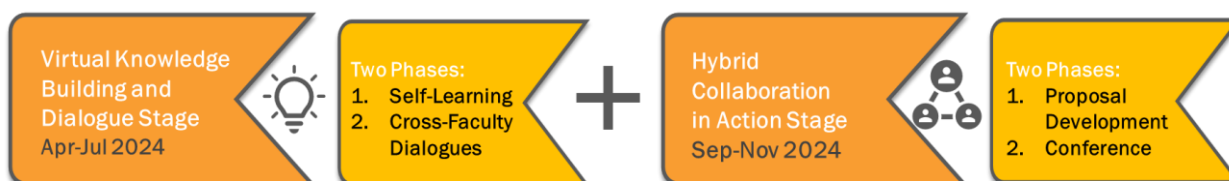
Image 3: Key Elements of Faculty Collaboration Activity of the ASEFClassNet17 Project

d. Conference [Nov 2024, venue (tbc)]: A 4-5-day long on-site conference will be organised to bring the participants of ASEFClassNet17 together. This is by 'invitation only' to showcase and further develop the Joint Proposals.