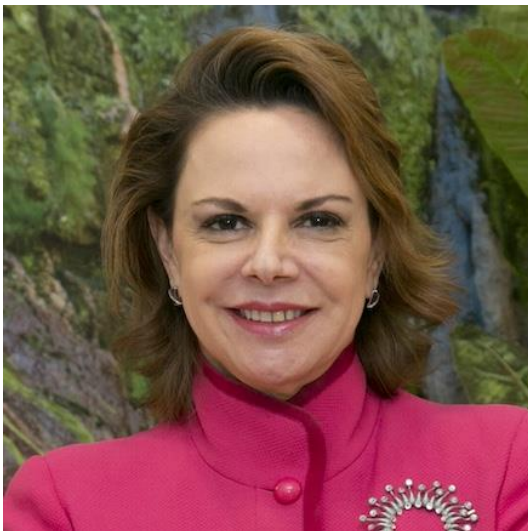
Ms Ana Helena CHACÓN ECHEVERRÍA Former Vice President of Costa Rica