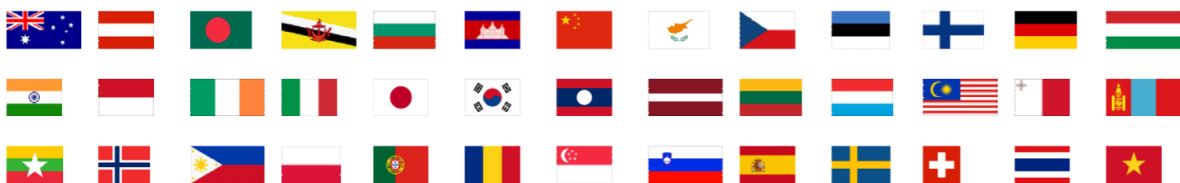
Flags represent countries that contributed to ASEF's General Pool for the previous year, as of 11 July 2025