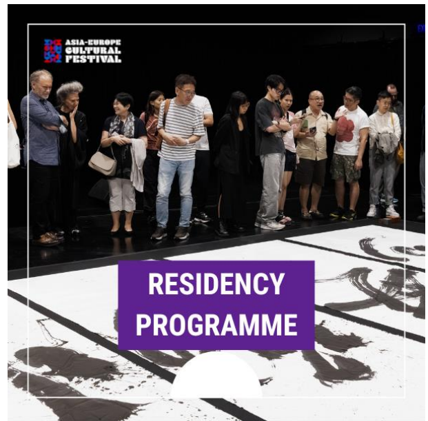
Asia-Europe Cultural Festival 2025 | Video