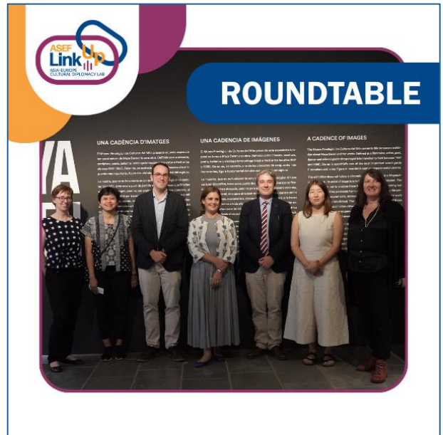
LinkUp: Cultural Diplomacy Lab 2025 | Video