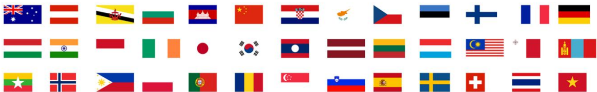
Flags represent countries that contributed to ASEF's General Pool for the previous year, as of 01 January 2026